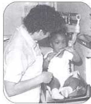
A well-child check-up. c. 1979

Advances in civil rights, the women's movement and heightened concern for the environment are major trends of the 70's. The population of the country tops two-hundred million as life-expectancy increases to 67.1 years for males and 74.8 for females. The first Earth Day is celebrated as American youth embrace environmental issues. The violent deaths of four Kent State University students horrify the nation as anti-war demonstrations heat up on campuses. The Supreme Court rules in favor of legalized abortion following the Roe vs. Wade decision. The World Health Organization (WHO) declares smallpox eradicated. The National Cancer Act is signed into law.