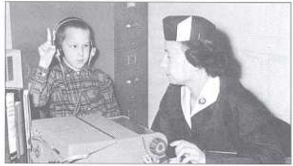
CCDPH nurse administering a hearing test. c. 1963

The age of youth, the 1960's represent a time of revolutionary change in the cultural fabric of America. Seventy million children from the post-war baby boom become teenagers and young adults. America faces a growing problem with recreational drug use. With 40% of Americans age 18 and older using tobacco products, the U.S. Surgeon General determines smoking a health hazard, paving the way for warnings to be posted on cigarette packs. Congress passes the Migrant Health Act, providing support for clinics serving agricultural workers. Motor vehicle safety efforts begin after Congress declares motor vehicle deaths "epidemic." The Head Start Program is introduced. Women are offered a new form of birth control: the pill. Sexually transmitted diseases increase dramatically, giving rise to great public health concerns.