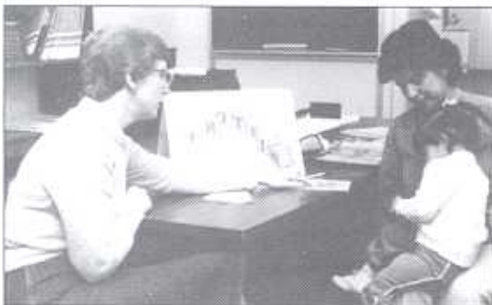
A WIC nutritionist discusses healthy eating habits during a counseling session. c. 1983