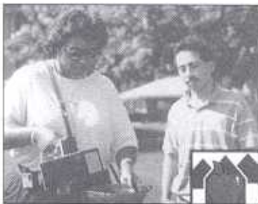
Testing for lead levels in pottery. © 1993

Computers are a normal part of work and home environments. The Americans With Disabilities Act passes, securing and protecting the rights of all Americans with physical or mental disabilities. The World Health Organization launches a special program to fight newly emerging infectious diseases after the first outbreak of the Ebola virus in Zaire. The Nutrition Labeling and Education Act is signed into law. The Ryan White Comprehensive AIDS Resource Emergency (CARE) Act begins, providing support for communities to help people with AIDS. The American Medical Association issues the first national Report Card on violence. The Brady Bill provides for a five day waiting period before purchasing a hand gun.