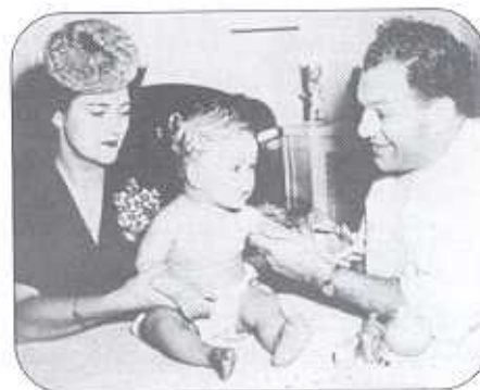
A doctor administers a protective immunization to the smallest patient. c.1946

The Communicable Disease Center in Atlanta is established, becoming the forerunner for the Centers for Disease Control and Prevention. Life expectancy is 60.2 years for males while females enjoy 68.2 years. Fifty-five per cent of American homes have indoor plumbing.