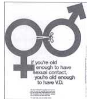
Sexually Transmitted Disease poster. c. 1977

☛ 1978: Legionnaires' Disease becomes a reportable communicable disease with CCDPH reporting four cases.