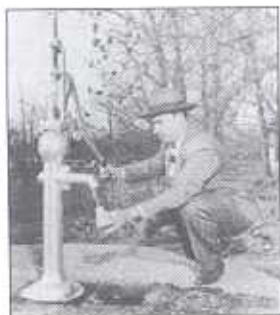
Environmental health inspector checking water at a Cook County forest preserve. c.1949.