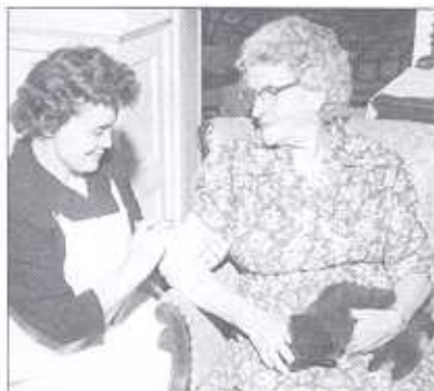
Left: CCDPH in-home nursing care for residents unable to visit clinics. c. 1960