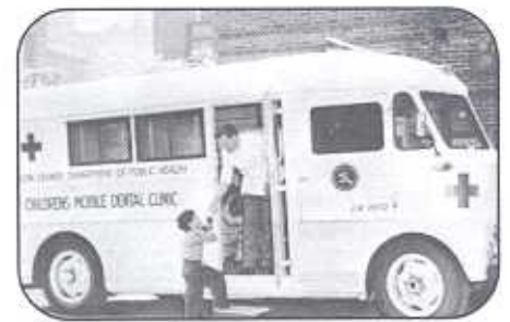
A department of public health mobile dentist gives a helping hand to this young man. c.1957