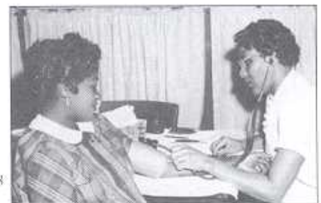
Right: Prenatal services in Robbins c.1958