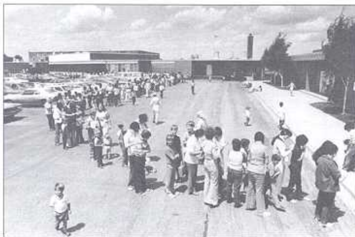
Over 2000 residents lined up for shots at a special measles immunization clinic at a north suburb. c.1975