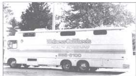
First WOW van. c. 1986