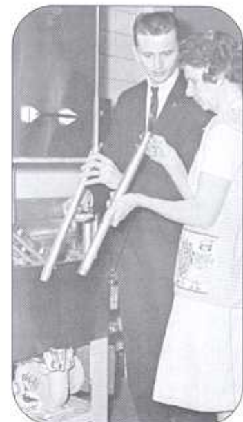
Right: Proper cleaning of a dishwashing machine is discussed by CCDPH sanitarian and restaurant employee. c. 1963