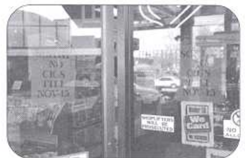
Unincorporated Cook County merchant in violation of tobacco ordinance prohibiting sales to youth under 18. © 1997

☞ 1998: CCDPH takes the lead role in a food-borne outbreak of enterotoxigenic Escherichia coli , or, ETEC, a form of traveler's diarrhea that affects the south and southwest suburbs. With over 5,000 residents sick, CCDPH works alongside the CDC to track the illness, collect data and supply the media with information. To date, this is the largest outbreak of its type in the United States.