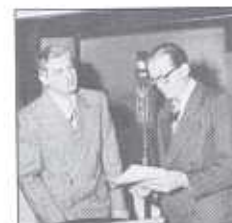
A series of special broadcasts over WGN Radio dramatized the health department's fight against Venereal Disease. c.1949